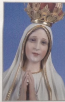
Our Lady of Fatima