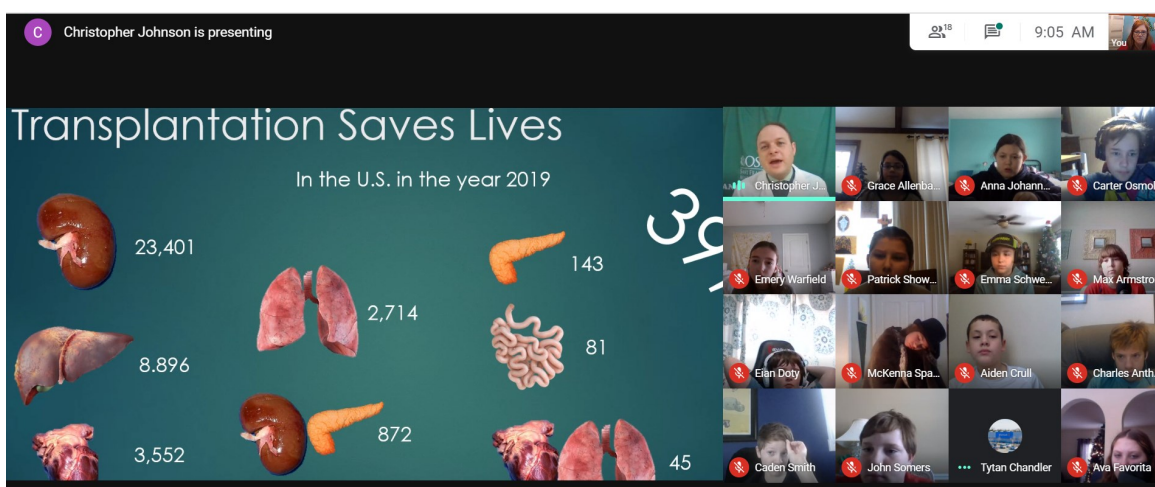
The slide of how many transplants for each organ