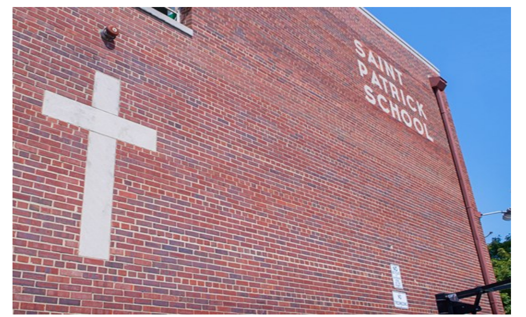
MESSAGE FROM THE PRINCIPAL