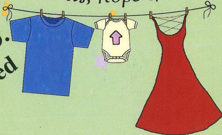
Photo I.D. Required