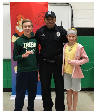
Winners of DARE Essay