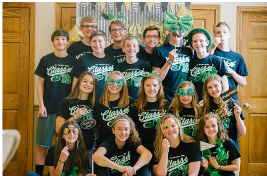
8th Grade Farewell Party at the KC