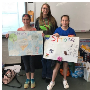
Posters will be displayed at the Peoria Chiefs Game