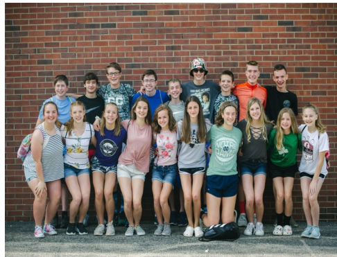
8th Grade Send Off