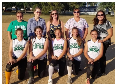
8th Grade Girls at their Jersey Ceremony