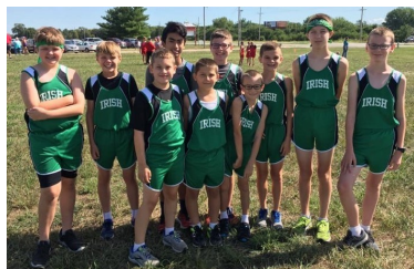
1st Cross Country Meet