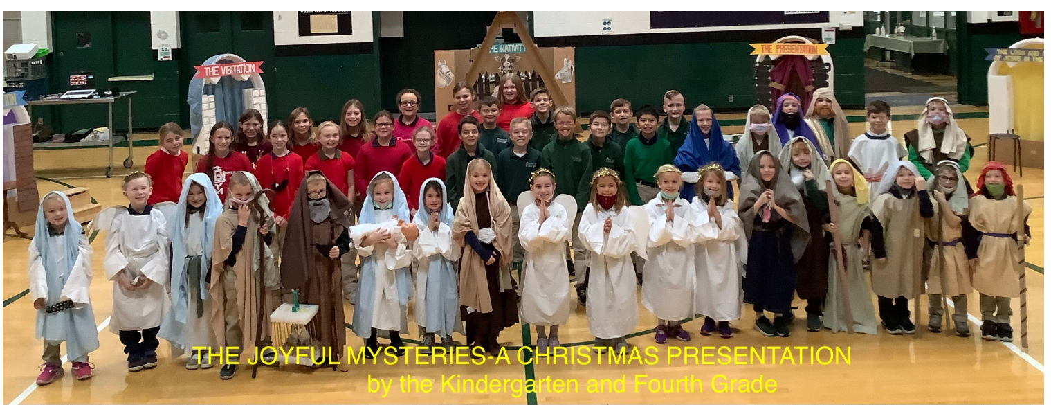
THE JOYFUL MYSTERIES-A CHRISTMAS PRESENTATION by the Kindergarten and Fourth Grade