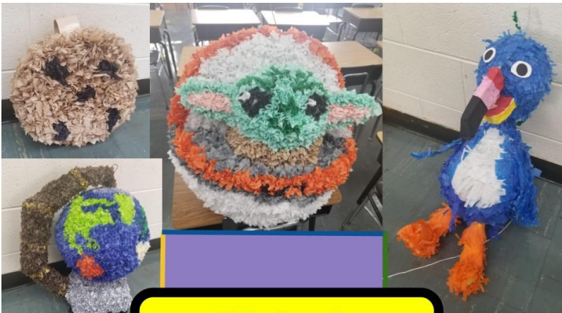
7th Grade Piñatas 2021-2022

St. Patrick School 100 Harvey Street Washington, IL 61571 309-444-4345 https://school.stpatswashington.com Facebook: St. Patrick Catholic Parish, Washington, IL