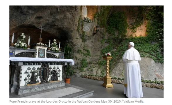
Pope Francis will also close the month of rosaries by leading the prayer in the Vatican Gardens May 31.

The rosary kicks off a month of daily rosaries prayed at Catholic shrines around the world for the intention of an end to the coronavirus pandemic and the resumption of work and social activities.