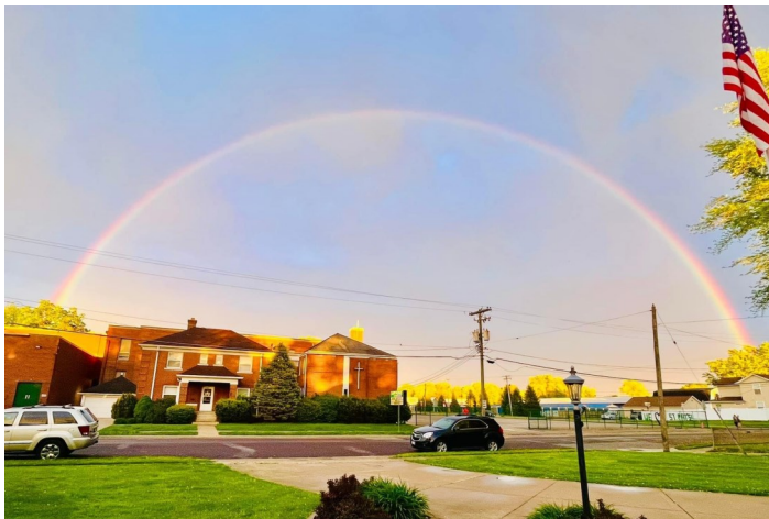
Rainbow over St. Patrick School

St. Patrick School 100 Harvey Street Washington, IL 61571 309-444-4345 https://school.stpatswashington.com Facebook: St. Patrick Catholic Parish, Washington, IL