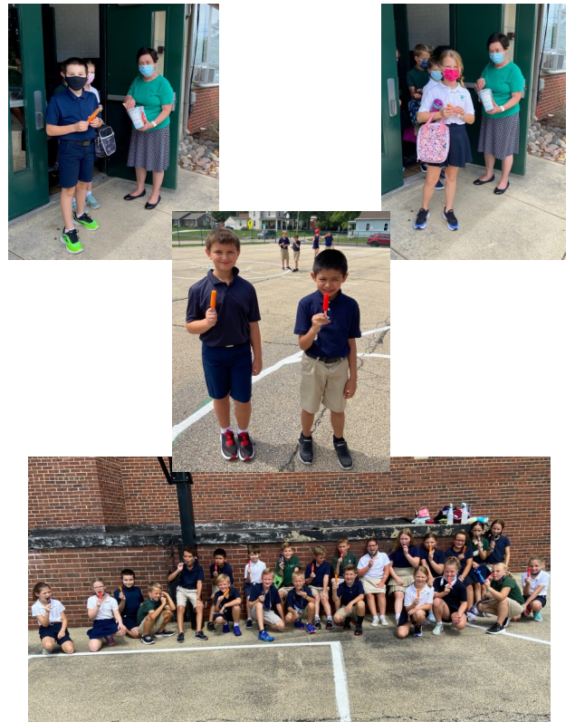
Thank you to St. Patrick's Parent Ministry for the cool treats!